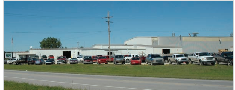
BOSS Tank - www.bosstank.com