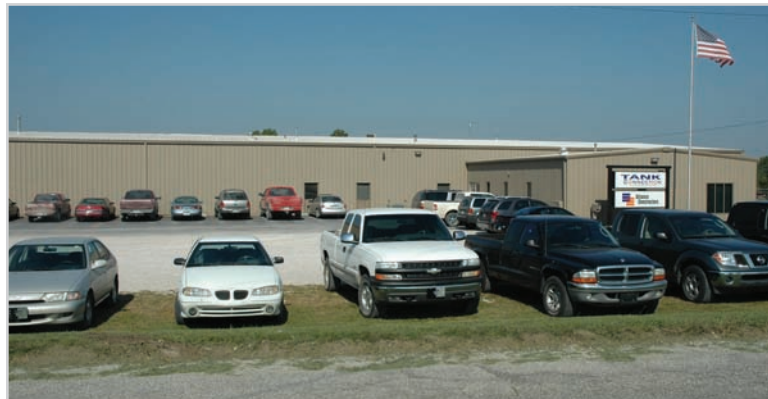
Tank Connection - www.tankconnection.com