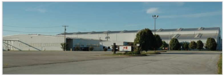
ATEC Steel - www.atecsteel.com

TARSCO - 50,000 sq. ft. facility dedicated to field-weld construction & refinery service